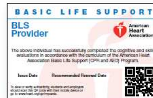
AHA eCards (certificate and wallet size)